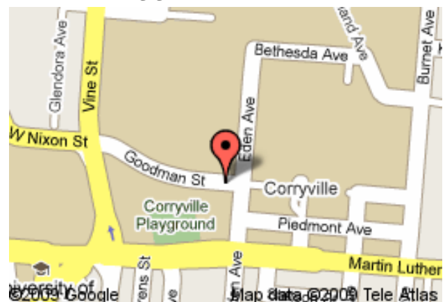
Kingsgate Conference Center

Scott will discuss the design and construction of concrete slabs on ground with an emphasis on slab jointing options and ways of minimizing the most common callbacks and complaints. The determination of slab thickness will be covered as well as how to select the type of design that will meet the Owners long-term expectations. Factors influencing the long-term performance of slabs on ground, including the evaluation of locally-available materials, will be covered.